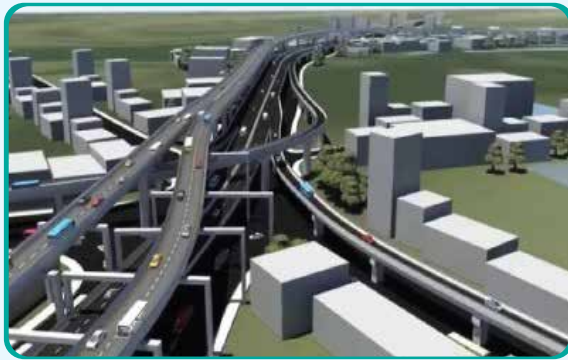
First Dhaka Elevated Expressway Project