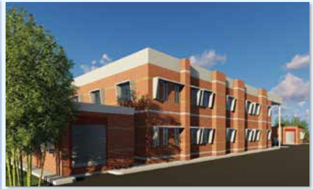
Metro Rail Line-6 (Building Construction Work)