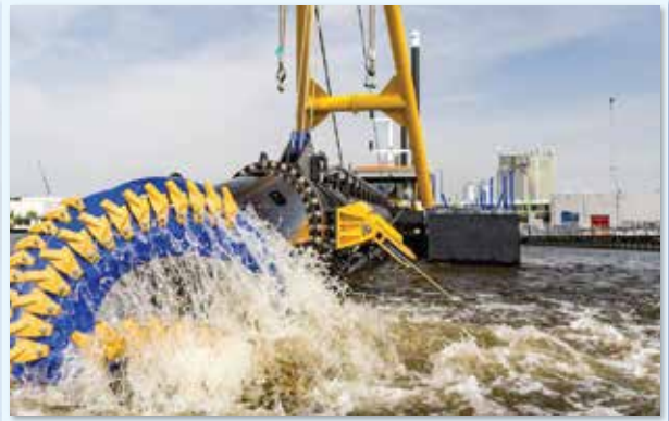
Dakatia River Dredging Project (Dredging Work)