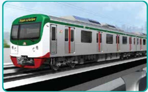
Dhaka Mass Rapid Transit Development Project