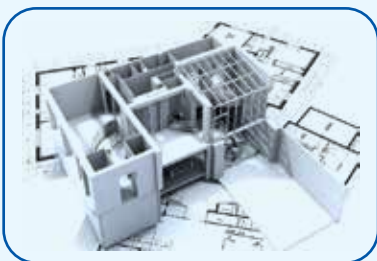
Design and Development