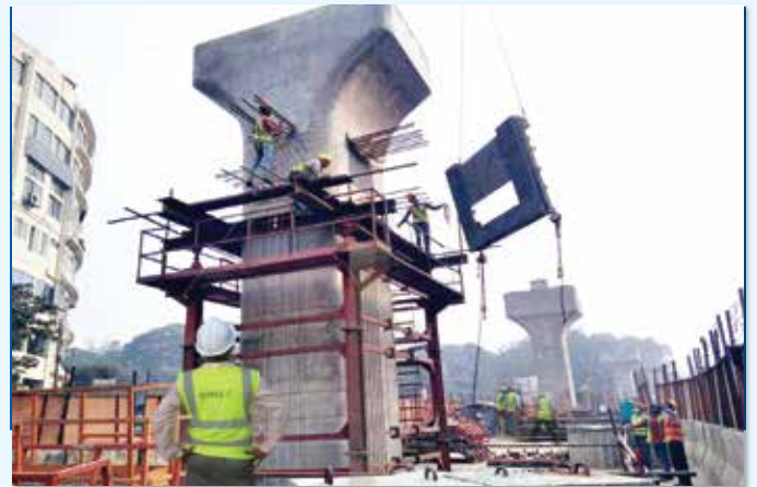
Metro Rail Line-6 (Elevated Work)