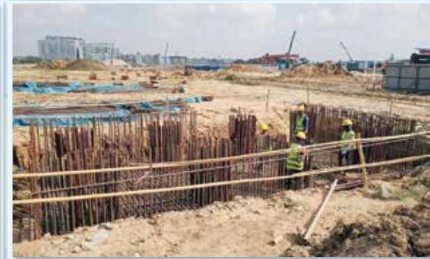
Airport 3rd Terminal Expansion Project