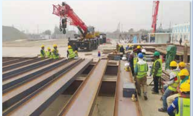
First Dhaka Elevated Expressway