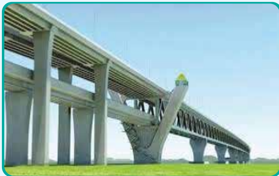
Padma Bridge Rail Link Project