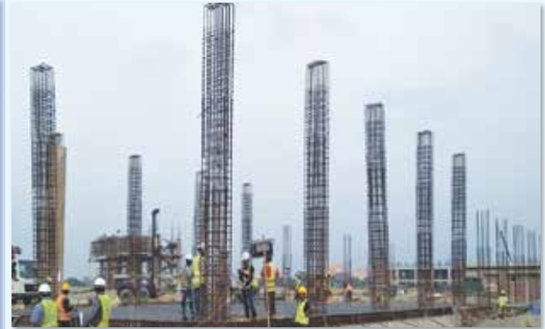
Airport 3rd Terminal Expansion Project