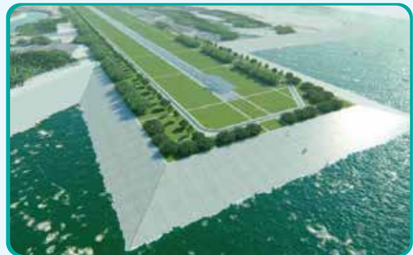
Cox's Bazar Airport Runway Expansion Project