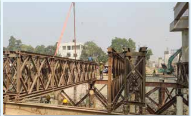
BRT Project- (Steel Fabrication Work)