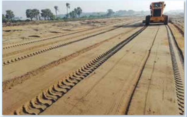
Padma Bridge Rail link Project (Embankment Work)