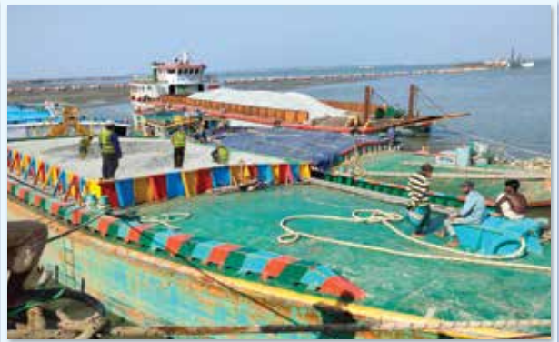
Cox's Bazar Airport Runway Expansion Project